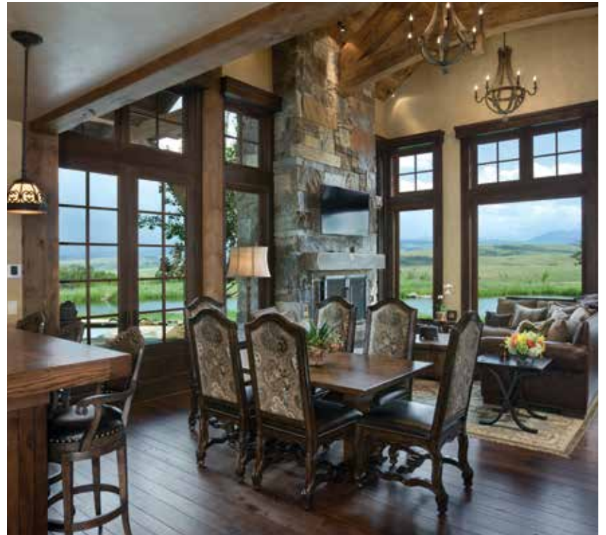
This page, clockwise from top: A bunk room was designed for frequent visits from the Gordys' grandkids. | Adjoining the main home by breezeway are two additional homes, one for each of the Gordys' sons and their families. | A casual dining and living room were created off the kitchen, offering an intimate space for when the Gordys are visiting on their own. | The workout room opens to the great outdoors, offering light and fresh air. Opposite page, from top: A formal great room looks to the mountains and provides a number of seating areas to accommodate frequent guests. | Seating areas located throughout the home create a comfortable setting for quiet conversations.

something unique, the oasis that now makes up the Double Arrow fit the bill.