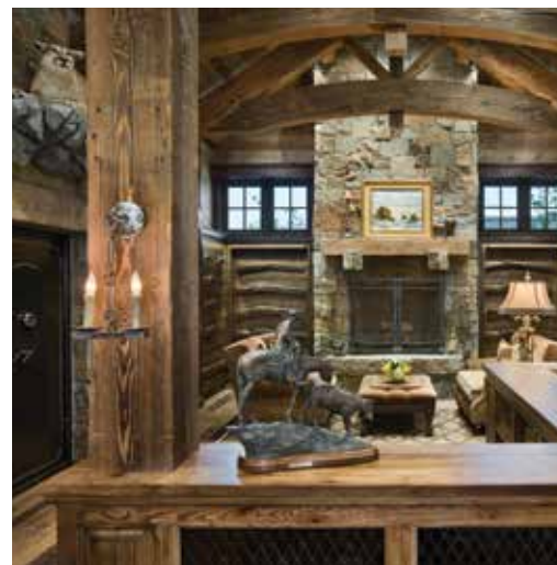
This page, clockwise from top: A well-adorned office is a quiet space with inspiring views. | The décor in the master suite is aligned with the rest of the home — a blend of rustic stone, timber and iron fixtures. | A sitting area was specifically designed to incorporate Russell’s antique gun collection. | The master bath leads to a hot tub overlooking the water and mountain views. Opposite page: The décor throughout the large, well-equipped kitchen features the same regal designs as the great room, including chairs with detailed craftsmanship and customized iron light fixtures.